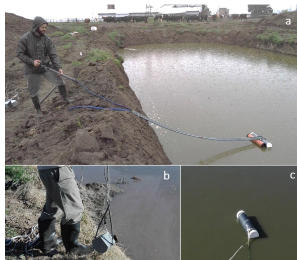
Figure 1 Device used for sampling. (a) Water extraction pump system with manual pump; (b) sediment collection dredge; and (c) surface buoy for Moore swabs.

Five grams or milliliters of each sample were resuspended in 50 ml of peptone water (Britania, Argentina) and incubated at 37 °C for 24 h. Subsequently, the presumptive detection of coliforms was carried out by inoculating 1 ml of the enriched culture into a tube containing 9 ml of MacConkey broth (Britania, Argentina) with a Durham tube, and incubated at 37 °C for 24 h. Positive samples (color change to yellow and gas production) were streaked onto Petri dishes containing MacConkey agar (Britania, Argentina) using a loop,