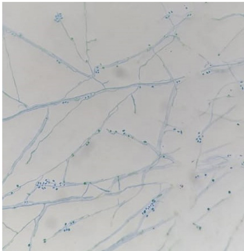
Figure 3 The microscopic morphology observed in the culture at 25°C showed septate hyphae and hyaline or slightly pigmented conidia that grouped into rosettes at the tips of the conidiophores (400×).

after Sporothrix schenckii sensu stricto in that country, and the highest reported so far in the Americas for this species 2 . In Argentina, at least three species of the genus Sporothrix were described to be circulating: S. schenckii sensu stricto (56.5%), S. brasiliensis (34.7%) and S. globosa (8.7%) 3 . According to Córdoba et al., the species identified as S. globosa were isolated only in 2004 and 2011 from rural workers residing in the province of Tucuman, in the northern region of Argentina, where the climate is hot and dry. These individuals acquired the infection from the environment, through traumatic injuries caused by splinters and wood stalks 3 .