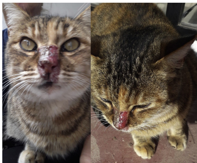
Figure 1 Ulcerative crusted facial lesions in the cat with sporotrichosis.

Samples of the cutaneous exudates collected through sterile swabs from the ulcerative lesions of the cat were also obtained for fungal culture and identification. For this purpose, fungal isolation was performed by spreading the specimens on Sabouraud dextrose agar supplemented with chloramphenicol (SDA) at 25°C and on brain heart infusion agar (BHI) at 37°C with daily observation. Microscopic mor-